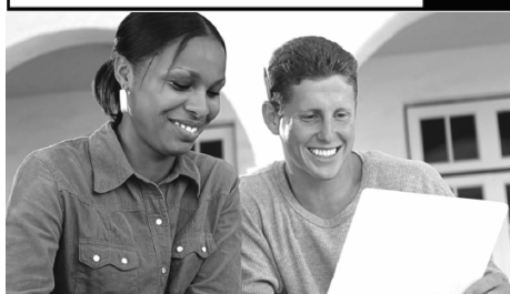
Preparing 21 st Century Ohio Learners for Success: The Role of Information Literacy and Libraries

A report by the INFOhio and OhioLINK Special Task Force to be released: September 30, 2008